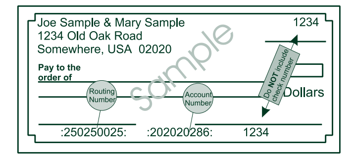
Note: The routing and account numbers may appear in different places on your checks.